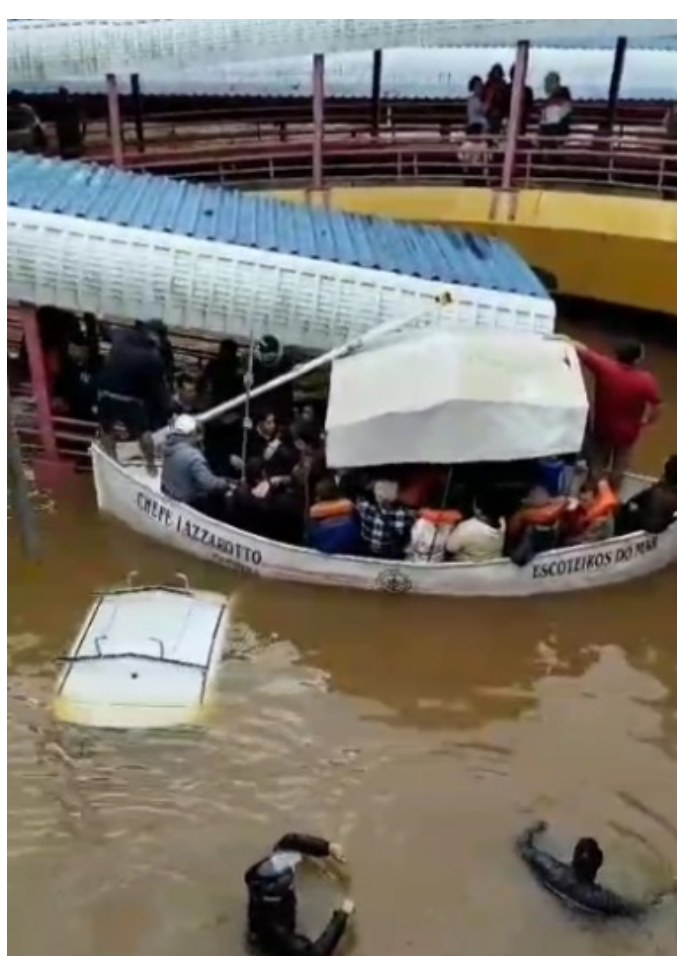
A vessel owned by the Brazilian Scouts assisting in the rescue of victims.